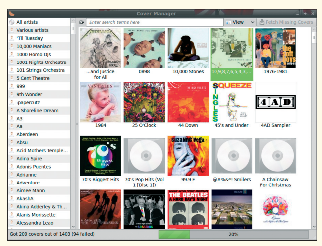
Figure 5: Fixing up album cover art.