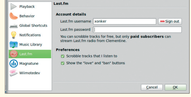
Figure 3: Configuring Last.fm with Clementine.

If you have a Magnatune account, be sure to enter that as well. Because the indie label switched to a download service, you can